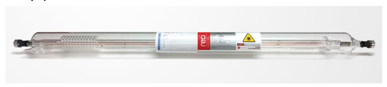
Figure 1 Location of safety symbols